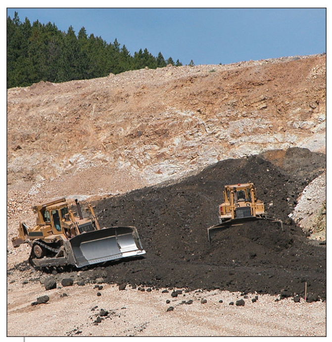
Stockpiled topsoil can be performance-boosted with pumice to enhance drainage and mitigate runoff while supporting vigorous plant cover.

There is a lot of savvy that goes into revitalizing and rebalancing soil to the point that re-established native plant species can thrive. Pumice is a ideal foundation upon which to build that soil design, providing immediate and lasting benefits as an economical inorganic amendment.