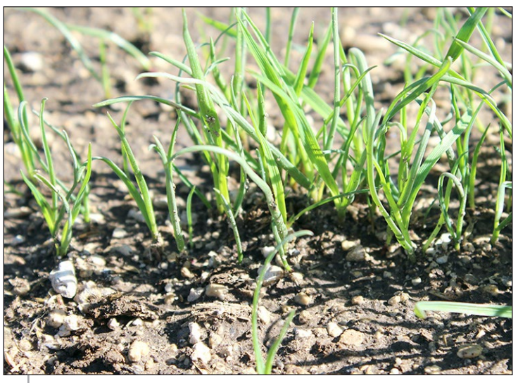
Heavy clay soil amended with 1/8 minus pumice to improve water- and nutrient-holding capacity, root-zone respiration, and compaction resistance in this newly-established turf.

Large-area soil structure, balance, and growth-sustaining performance can be improved economically with pumice.