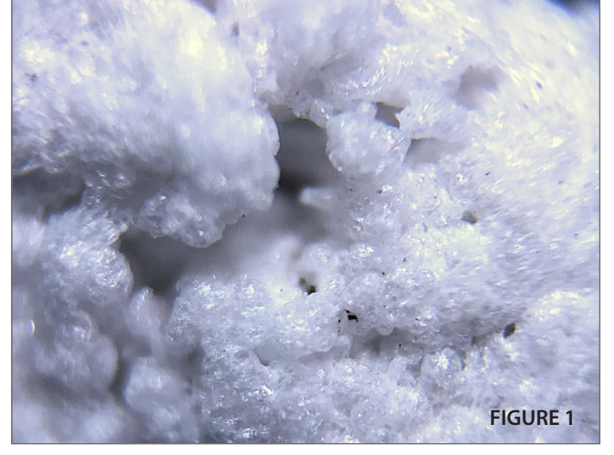
Above: Extreme close up of expanded perlite. Below: #2 grade pumice at 100x magnification. Bottom: Extreme close up of the surface of a pumice stone from the Hess deposit.

Physicochemical Structure . There is no performance drop using pumice instead of perlite for potting soils or to amend poor native soils. Both have a foamed-stone nature that is ideally purposed to condition soils. A University of Illinois research project<sup>2</sup> studied pumice as a perlite substitute for containerized growing. Specifically, the chemical properties and surface characteristics were compared. They proved analogous,