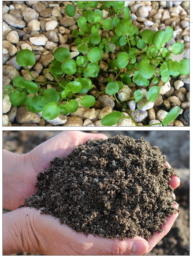
Top: Watercress seedlings thrive in an aquaponics system using pumice media. Above: Composted garden soil conditioned with a 1/8 fines grade pumice. Below: Pumice in a 1/8 fines grade, meaning a top particle size of 1/8 inch down to powdery fines. Bottom: Pumice crushed and screened to a grade #10.